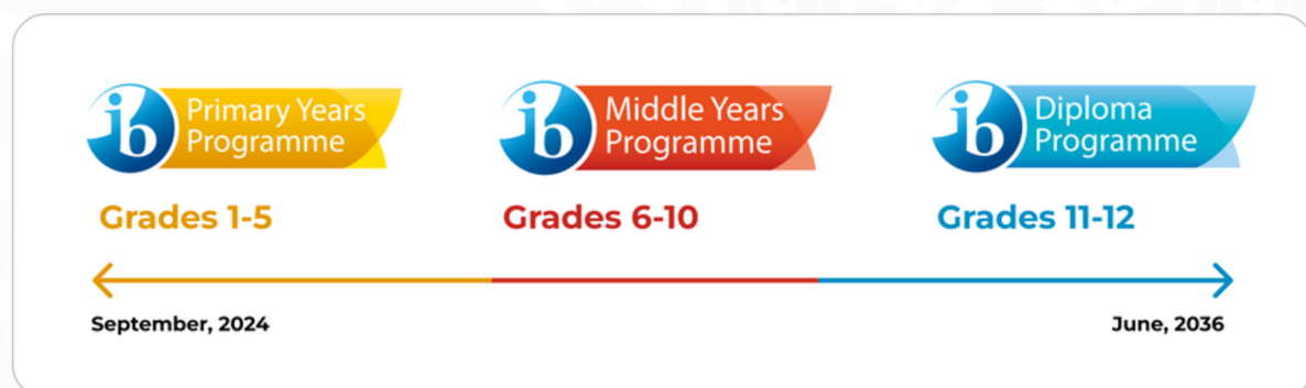
Picture 2: Correspondence of the three IB programmes to the grades at IUIS

The Ashgabat Campus of IUIS is a modern learning space intended for the education of students from grades 1 to 12. AC provides education through three main International Baccalaureate Programs: Primary Years Programme (PYP) for grades 1-5, Middle Years Programme (MYP) for grades 6-10, and Diploma Programme (DP) for grades 11-12 (Picture 2).